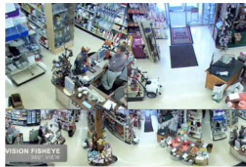
Dewarped Image: 2 PTZ views & 1 360 degree view